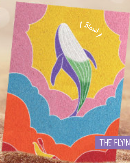
THE FLYING WHALE